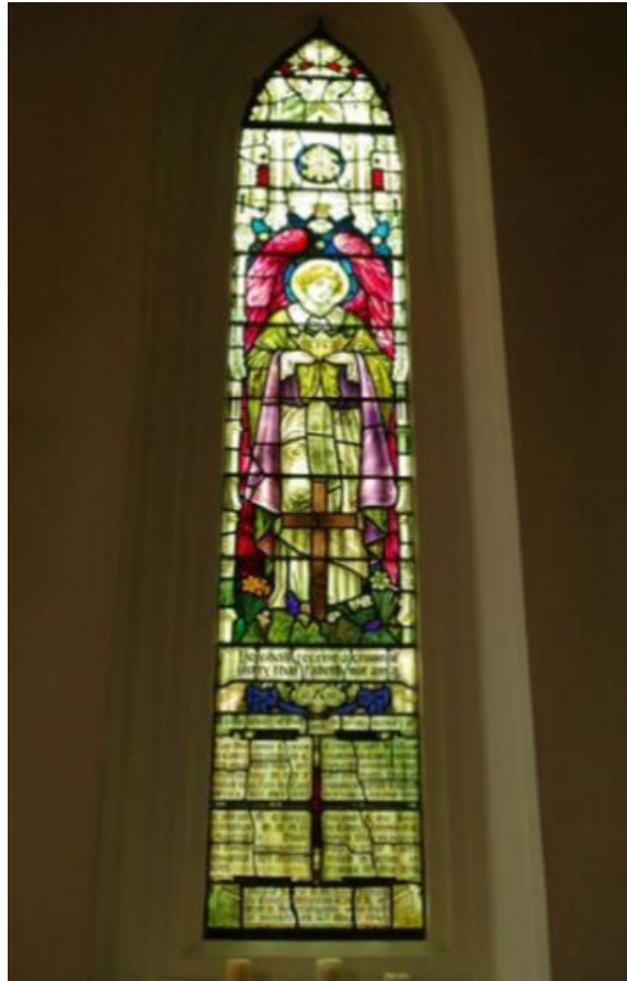
Holy Trinity Church, Salcome

Conrad De Courcy Stretton is remembered in a glass stained window located in Holy Trinity Church, Salcome, South Hams, Devon, England.