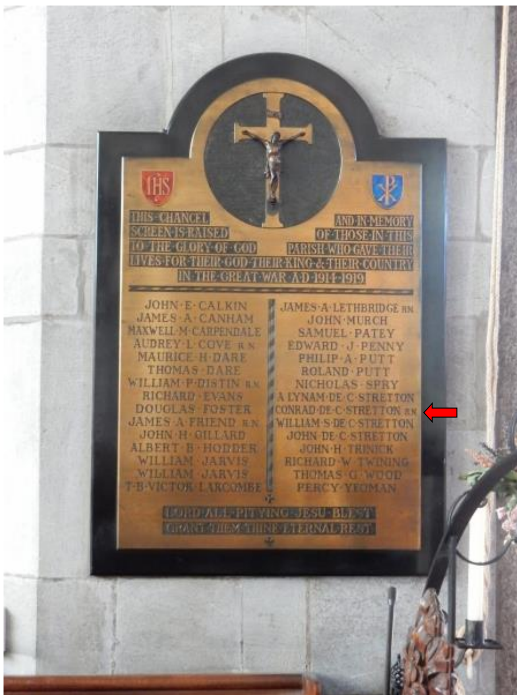
Salcombe Holy Trinity Church Roll of Honour