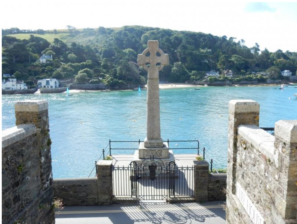
Salcombe War Memorial