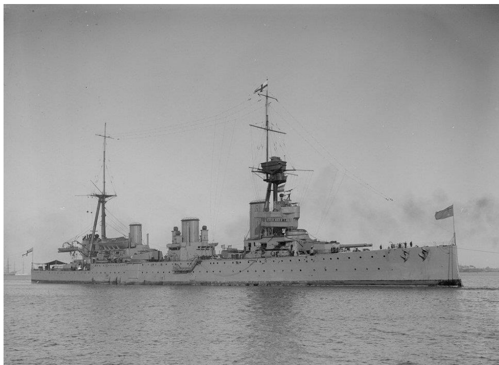
H.M.A.S. Australia 1914

In late December, 1914 Australia received orders to sail to England via the Pacific and reached Devonport on 28th January, 1915. En route she captured and sank von Spee's supply ship Eleonore Woermann off South America. From Devonport Australia proceeded to Rosyth in Scotland, where in February, 1915 she became flagship of the 2nd Battle Cruiser Squadron. The squadron, as initially formed, comprised Australia and her two sister ships, HMS New Zealand and HMS Indefatigable .