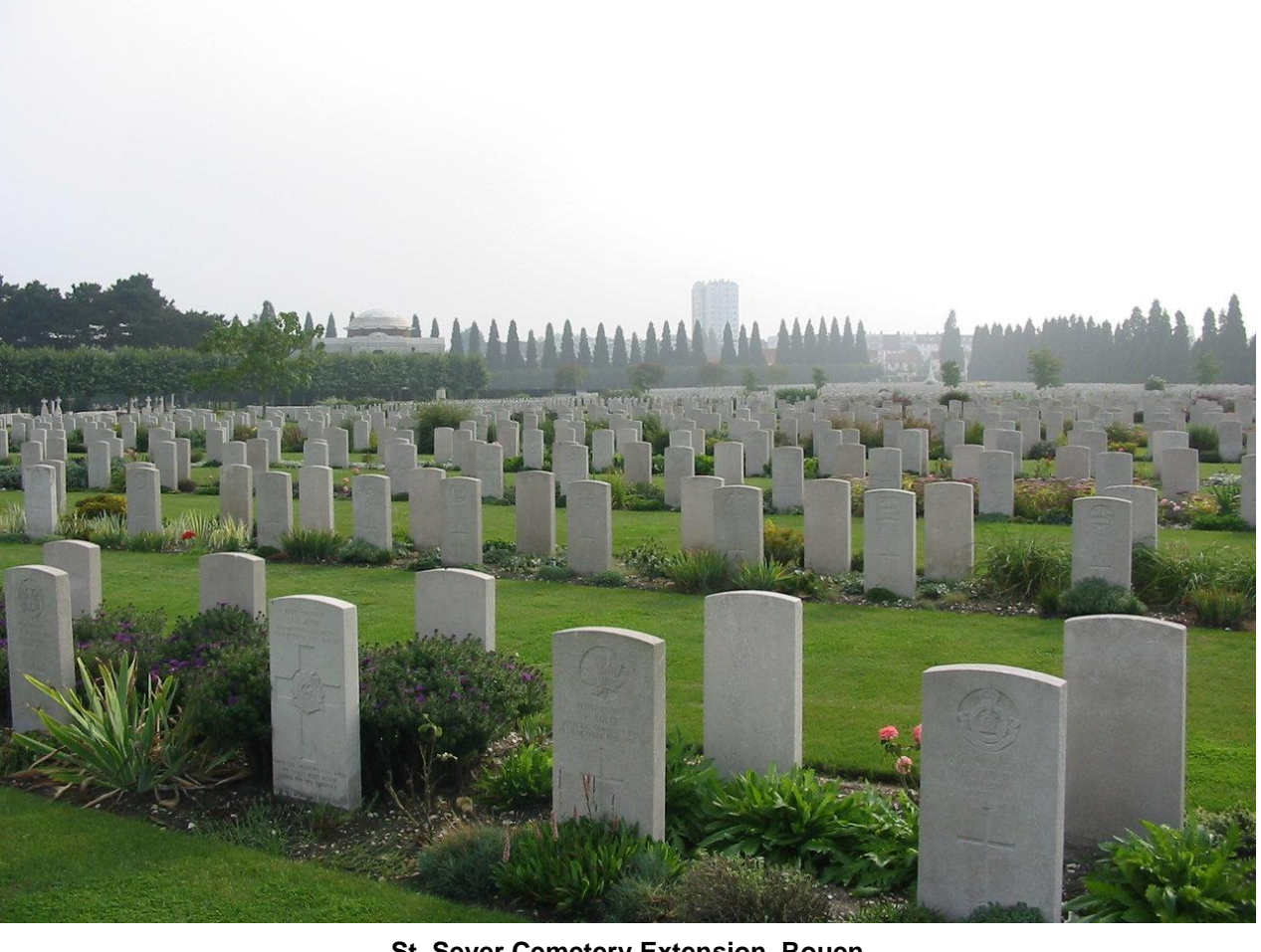
St. Sever Cemetery Extension, Rouen