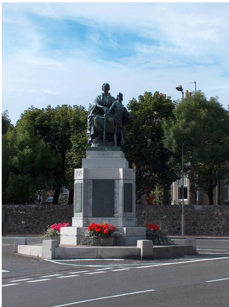
Fraserburgh War Memorial