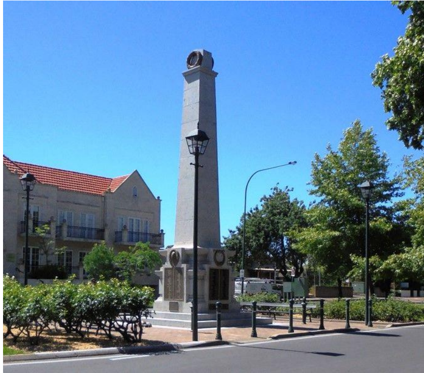
Norwood War Memorial