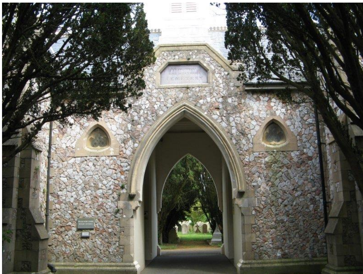
Broadwater Cemetery, Worthing

Broadwater Cemetery, Worthing contains 81 Commonwealth War Graves – 78 from World War 1 & 3 from World War 2.