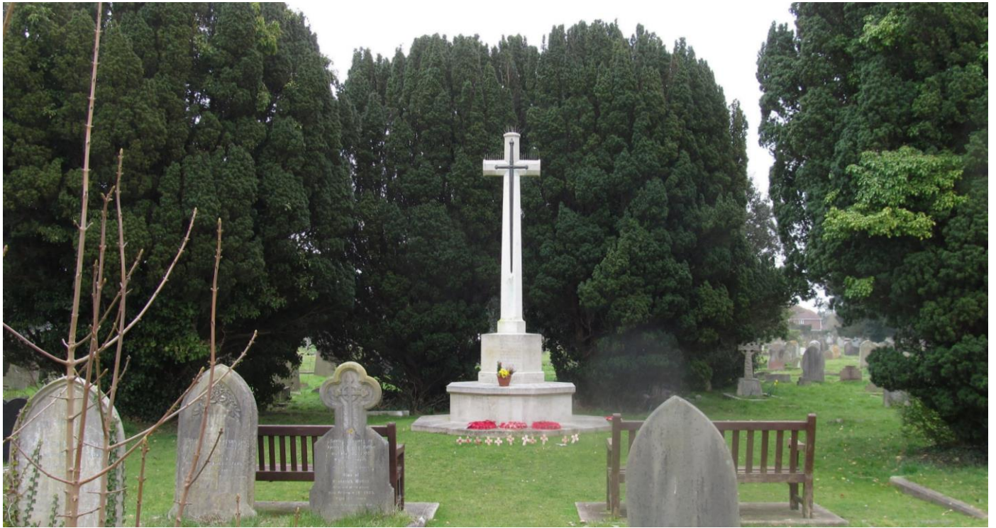
Cross of Sacrifice, Broadwater Cemetery, Worthing