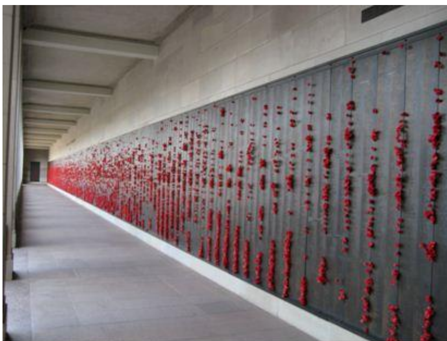
Roll Of Honour WW1 Australian War Memorial Canberra, Australia

Private C. G. Compton is commemorated on the Roll of Honour, located in the Hall of Memory Commemorative Area at the Australian War Memorial, Canberra, Australia on Panel 136.