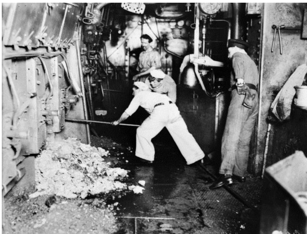
Unidentified stokers at work in the boiler room on board HMAS Australia . (Photo period 1914-1918)