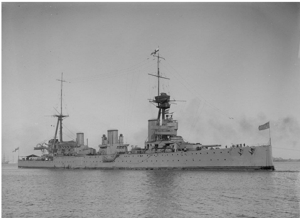
H.M.A.S. Australia 1914