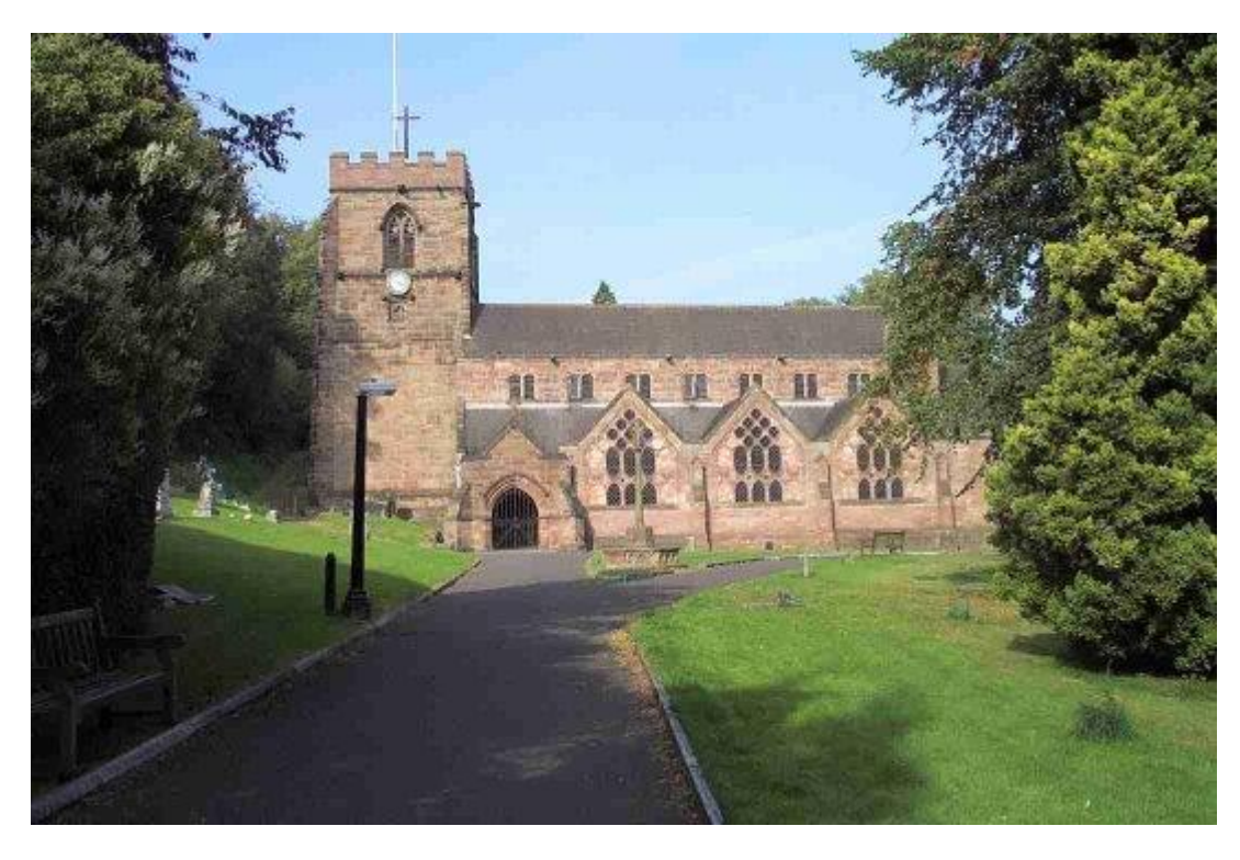
St. Michael and All Angels Church, Tettenhall Regis

St. Michael's Churchyard, Tettenhall Regis, Marchington, Staffordshire contains 25 Commonwealth War Graves – 15 relating to the First World War & 10 relating to the Second World War.