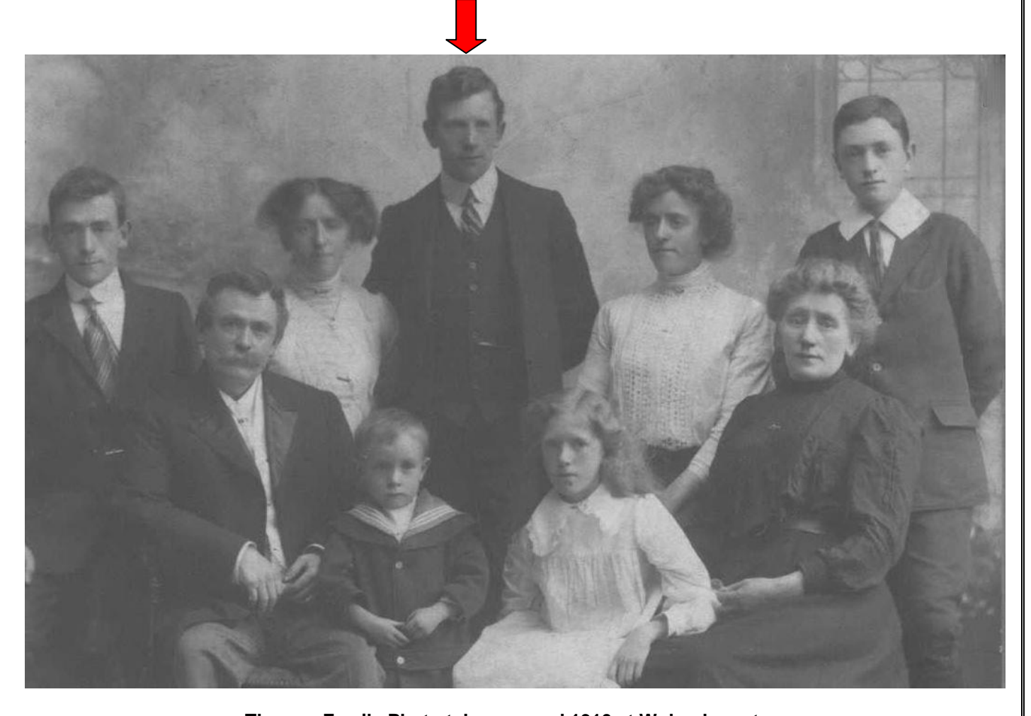
Thomas Family Photo taken around 1910 at Wolverhampton

(Western Mail, Perth, Western Australia – 19 November, 1915)